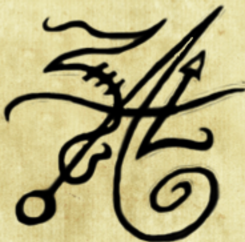
Demonosophy Sigil of Lord Azazel

This sigil is the one that he shared with our coven that can be used for connecting with and working with his energies.