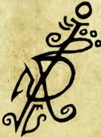
Demonocophy Sigil of Lord Beelzebub

This sigil is the one that he shared with our coven that can be used for connecting with and working with his energies.