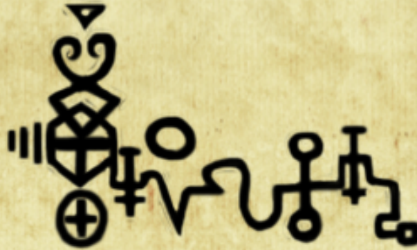
Demonosophy sigil of Lord Lucifer

This sigil is the one that he shared with our coven that can be used for connecting with and working with his energies.