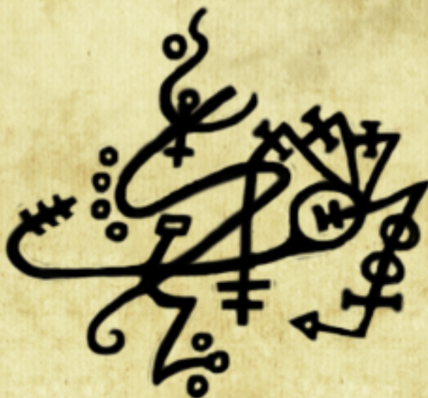
Demonosophy Sigil of Lord Satan

10) Carve the sigil of Satan on his candle and then anoint the candle in his name. Say.