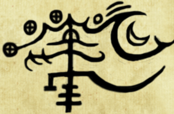
Demonosophy Sigil of Lord Leviathan

This sigil is the one that he shared with our coven that can be used for connecting with and working with his energies.